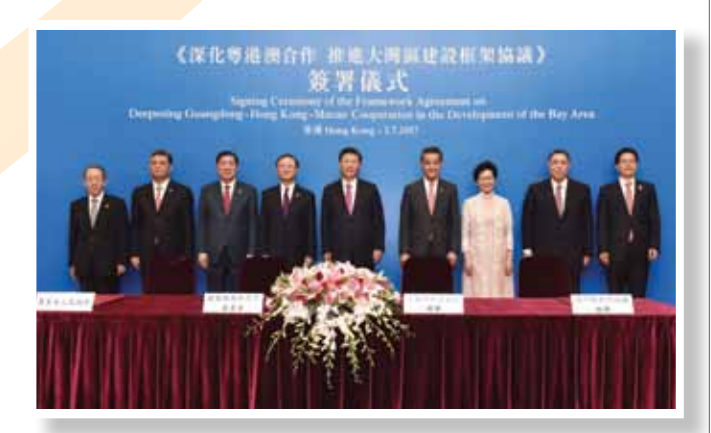
Above: Signing ceremony for the Framework Agreement on Deepening Guang-dong-Hong Kong-Macao Cooperation in the Development of the Bay Area.

The Hong Kong government will now work with the governments in Guangdong and Macao to continue working towards a "world-class city cluster". This will boost not only the wider Pearl River Delta region but the whole of central-south and south-western China. The Chinese government's National 13th Five-Year Plan, launched in March 2016, recognises Hong Kong's unique role in helping to develop the whole Chinese economy and open it up to other countries.