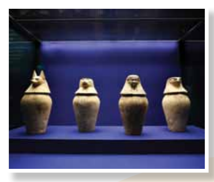
Above: Canopic jars of Djedbastiuefankh from around 380 to 343 BC are among the priceless exhibits on show at the Eternal Life – Exploring Ancient Egypt exhibition.

The exhibition is jointly presented by the Leisure and Cultural Services Department and the Trustees of the British Museum, and co-organised by the Hong Kong Science Museum and the British Museum, with sole sponsorship from the Hong Kong Jockey Club Charities Trust. The exhibition runs until October 18.