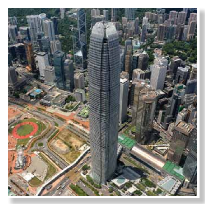
Above: Hong Kong has been judged the most competitive of 63 developed economies.