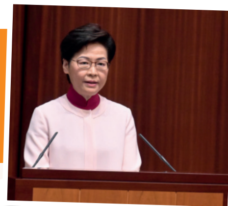
Above: Chief Executive, Mrs Carrie Lam, presents the Policy Address to the Legislative Council.

F or her fifth and last Policy Address under the current administration, an upbeat Chief Executive of the Hong Kong Special Administrative Region (HKSAR), Mrs Carrie Lam, set out key goals for the future.