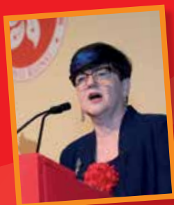
Left: London, United Kingdom Commercial Secretary to HM Treasury, Baroness Neville-Rolfe, delivers a speech at the reception in London.