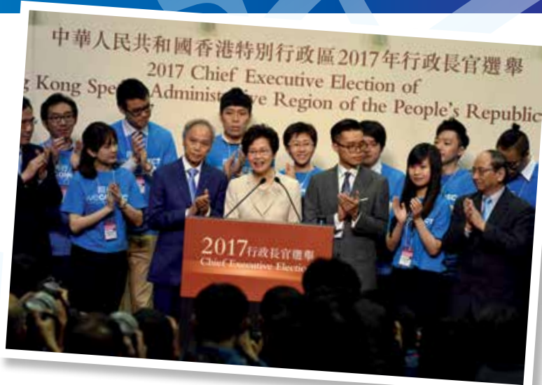
Above: Mrs Lam (front row, fourth right) after winning the election to become the fifth-term Chief Executive of Hong Kong.

Mrs Lam was the Director-General of the Hong Kong Economic and Trade Office, London, from 2004-2006 before returning to Hong Kong to take up the position of Permanent Secretary for Home Affairs. In 2007, she was appointed Secretary for Development and in 2012 became Chief Secretary for Administration in the Fourth Term of the HKSAR Government.