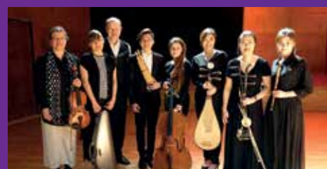
Above: Members of the Tapiola Sinfonietta pictured with an ensemble of four young musicians from Hong Kong.

Organised by Hong Kong's Musicus Society, the concerts are part of the programme of events of The Hong Kong Economic and Trade Office, London (HKETO), to celebrate the 20th anniversary of the establishment of Hong Kong Special Administrative Region (see page four). HKETO hosted a reception for the Musicus Society before the Espoo concert.