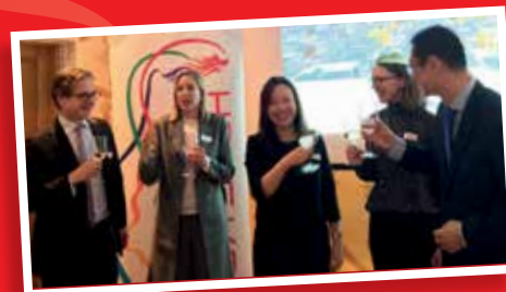
Above: Gothenburg, Sweden Key speakers and guests toasting the Year of the Rooster at the seminar cum reception in Gothenburg.