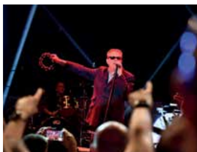
Above: British band Madness performs at the tournament.