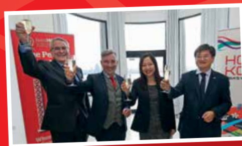
Above: Liverpool, United Kingdom Key speakers and guests toasting the Year of the Rooster at seminar cum reception in Liverpool.