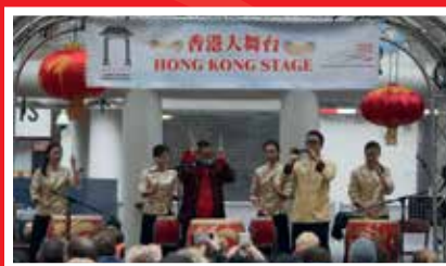
Above: London, United Kingdom The Hong Kong Drum Ensemble performs on the "Hong Kong Stage", supported by the HKETO, in Charing Cross Road.