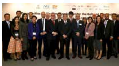
Above: Professor Cheung (front row, centre) with representatives from the Hong Kong Maritime and Port Board delegation, the Cass Business School and other guests at a seminar and networking lunch in London.

Professor Anthony Cheung Bing-leung, Secretary for Transport and Housing, visited London in February to promote the strengths of Hong Kong's maritime and aviation services industries.