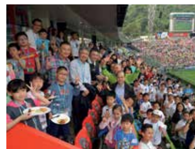
Above: Fans enjoy the atmosphere at the Hong Kong Stadium.

An expected $2 million was also raised for charity through fundraising events during the tournament. As part of the event, the Government and the Mission Possible Foundation also hosted a special party to give 100 disadvantaged Hong Kong children the chance to enjoy the Rugby. The tournament was one of the high profile events to celebrate the 20th anniversary of the establishment of the Hong Kong Special Administrative Region (see page four).