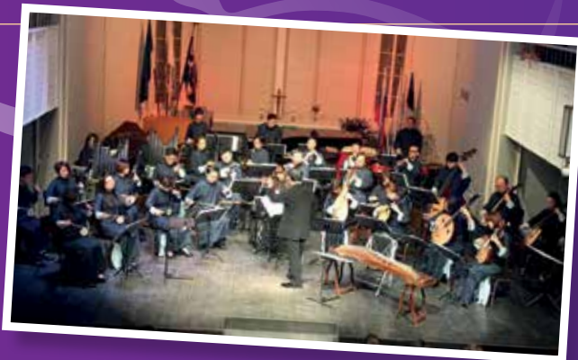
Above: The Hong Kong Chinese Orchestra performs in St Petersburg in February.

Founded in 1977, the HKCO is a professional, full-sized Chinese orchestra in Hong Kong funded by the Government. Its tour to Russia formed part of HKETO's celebration programme to commemorate the 20th anniversary of the establishment of the Hong Kong Special Administrative Region (see page four).