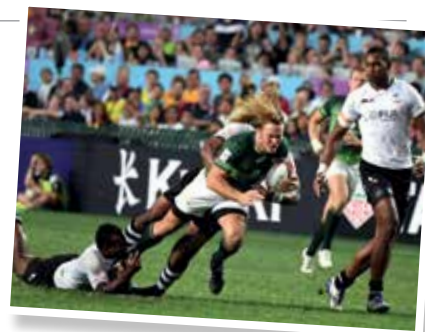
Above: Sevens Fiji vs South Africa.

On the pitch, Fiji beat South Africa 22-0 to win the trophy in front of 40,000 fans at the Hong Kong Stadium. Around the city, visitors and Hong Kong citizens enjoyed rugby revelry in the form of concerts, carnivals and crazy costumes throughout the three-day event.