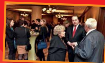
Above: Moscow, Russia Guests mingling at the reception in Moscow.