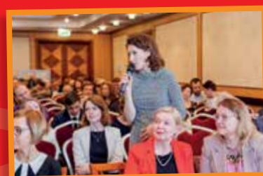
Above: St Petersburg, Russia Representatives from government and business attend a business seminar and reception to mark Chinese New Year.