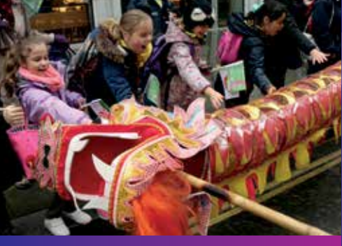
Children enjoy getting close to a Hong Kong dragon.