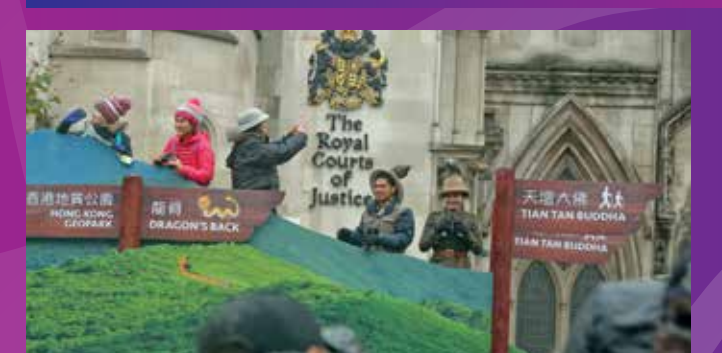
Hong Kong's float passes the Royal Courts of Justice, where the Lord Mayor swears allegiance to the reigning monarch.