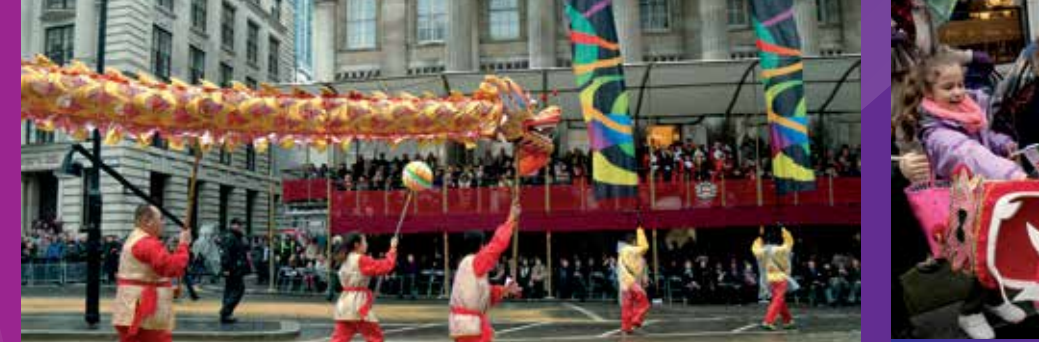
Dragon dancers perform in front of the Lord Mayor's residence, Mansion House.

It's the 12th year HKETO has entered a float in the show, which celebrates the swearing-in of the new Lord Mayor of London. More than half a million people take to the streets to see the parade each year, while the BBC broadcasts it live to millions of people in Britain and globally.