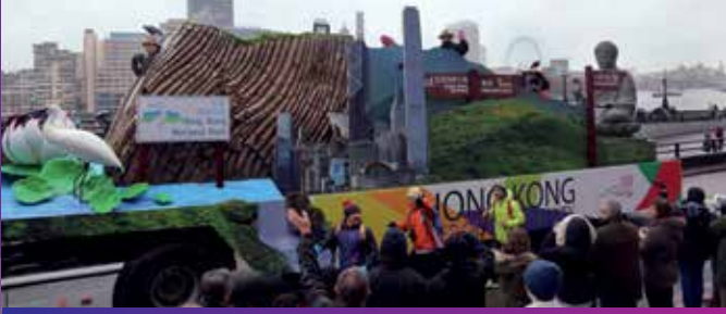
This year's float highlighs the visual treasures just outside the urban areas of Hong Kong: the famous Dragon's Back hiking trail, the fascinating rock structures of the Hong Kong Geopark, the Hong Kong Wetland Park, and the giant Tian Tan Buddha on Lantau Island.