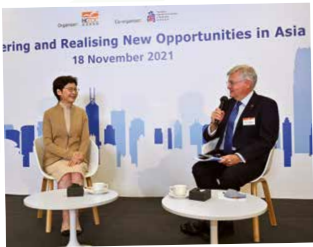
Above: Chief Executive, Mrs Carrie Lam (left) fielding questions from participants during the question-and-answer session.

The event also examined Hong Kong’s unique role as a multi-faceted hub which UK businesses can leverage to capture new opportunities in the dynamic Asian market, in particular the Greater Bay Area, spotlighting on topical issues in finance, business expansion in Asia and healthcare.