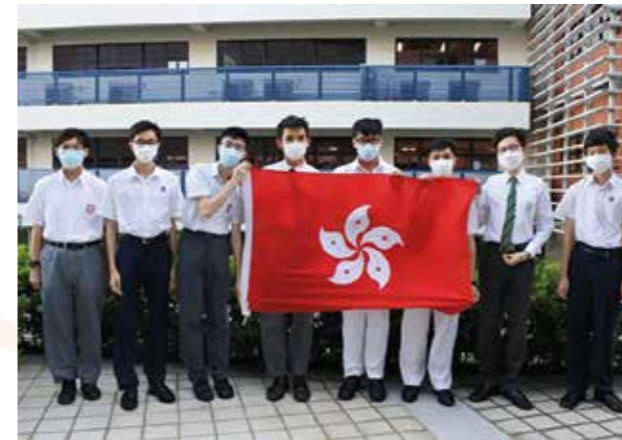
Above: Hong Kong's victors at sixth International Olympiad of Metropolises.

Eight Hong Kong students put in a stellar performance at the sixth International Olympiad of Metropolises, a global competition covering informatics, mathematics, physics and chemistry.