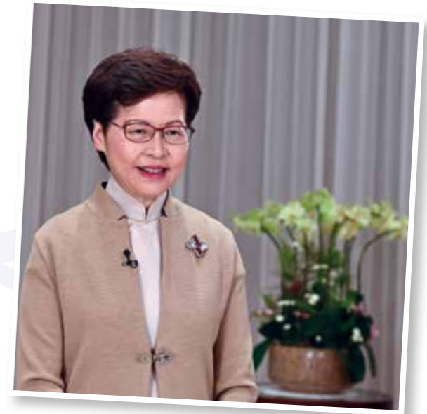
Above: Chief Executive, Mrs Carrie Lam, delivered a video speech at the opening ceremony of Business of Design Week 2021.

Addressing the opening ceremony, Hong Kong's Chief Executive, Mrs Carrie Lam, said she was honoured that the government was the event's lead sponsor through the CreateSmart Initiative. "We are highly committed to developing the creative industries as our new economic drivers; with a new HK$1 billion injection into the CreateSmart Initiative," she told the audience.