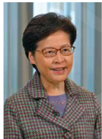
Above: Chief Executive, Mrs Carrie Lam, addressed the 15th Asian Financial Forum by video.

The global economic outlook, climate risks and Green investment trends were among topics explored during this year's two-day Asian Financial Forum.