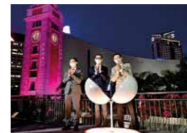
Left: The then Secretary for Home Affairs, Caspar Tsui (right) officiates at the ceremony to celebrate the centenary of the chiming of the Tsim Sha Tsui Clock Tower Bell.

Made from red brick and granite, the 44-metre structure will sound the hours between 8am and midnight.