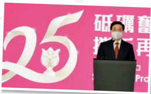
Above: Chief Secretary for Administration, John Lee, unveiled a series of signature events to mark the 25th Anniversary of the Hong Kong Special Administrative Region.