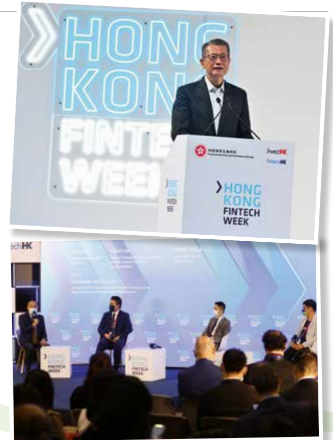
Above Right: Financial Secretary, Paul Chan, at FinTech Week’s opening ceremony. Right: Secretary for Financial Services and the Treasury, Christopher Hui (first left), moderated a panel session: ‘Fintech Innovations for Cross-Border Banking and Insurance Services in the Greater Bay Area’.

The five-day event championed ‘Scaling FinTech Future Together’, a celebration of Hong Kong as an attractive hub for start-ups and scale-ups in the region, and a showcase of exciting fintech collaboration. It was led by the Financial Services and the Treasury Bureau and Invest Hong Kong, co-organised by the Hong Kong Monetary Authority, the Securities and Futures Commission, and the Insurance Authority.