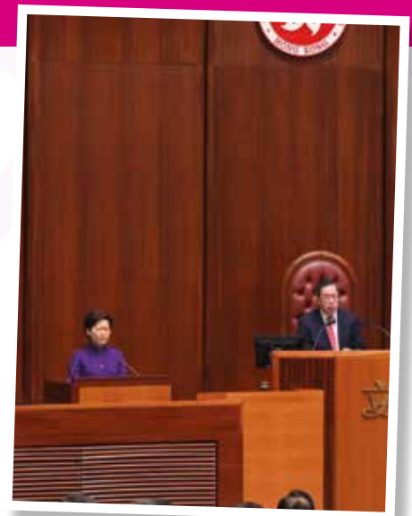
Above: Hong Kong's Chief Executive, Mrs Carrie Lam, addresses the new LegCo.