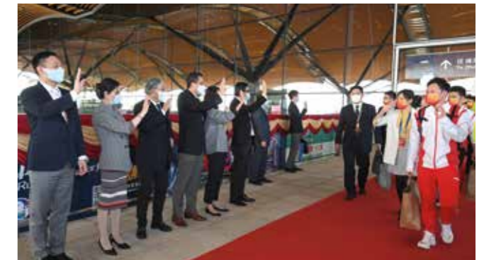
Above: The then Secretary for Home Affairs, Caspar Tsui (first left) waves goodbye to the Tokyo 2020 Olympic Games Mainland Olympians Delegation.

A spokesman for the Hong Kong Special Administrative Region said that the Government is extremely grateful to the Chinese Olympic Committee for sending the delegation to visit Hong Kong and meet members of the public in Hong Kong.