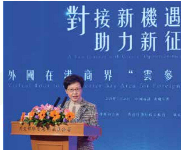
Above: Chief Executive, Mrs Carrie Lam, speaks at A New Journey with Greater Opportunities – Virtual Tour to the Greater Bay Area for Foreign Businesses in Hong Kong.

In a keynote speech, Chief Executive Mrs Carrie Lam said companies in Hong Kong, which have a head start, will stand to reap opportunities from the GBA. Mrs Lam said its expansion is more than a regional development project, it is a platform that would bring Hong Kong closer with Mainland cities, and enhance its international trade and cooperation.