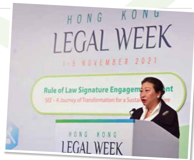
Right: Speaking at the opening, Justice Secretary Teresa Cheng, SC, (pictured above) pointed out that the scope of the UNCITRAL Asia Pacific Judicial Summit had been expanded in 2021 to cover more topics beyond arbitration such as insolvency and public-private partnership.

Attracting over 80 judges (both in person and online), the event began with the 4th UNCITRAL Asia Pacific Judicial Summit, jointly organised by the Department of Justice and the United Nations Commission on International Trade Law.