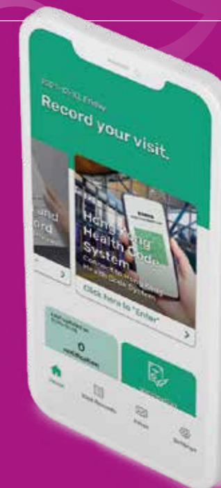
Above: Residents can upload their visit records to the Hong Kong Health Code system through the "LeaveHomeSafe" app.