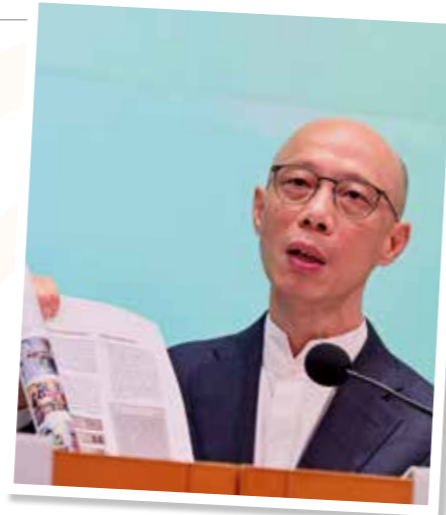
Above: Secretary for the Environment, Wong Kam-sing, unveils Hong Kong's Climate Action Plan 2050.

Launching the updated strategy, Environment Secretary, Wong Kam-sing, said: "The new plan outlines the four major decarbonisation strategies and measures, namely: net-zero electricity generation, energy saving and green buildings, green transport and waste reduction." He admitted that this will require a long-term commitment from everyone in "unwavering efforts".