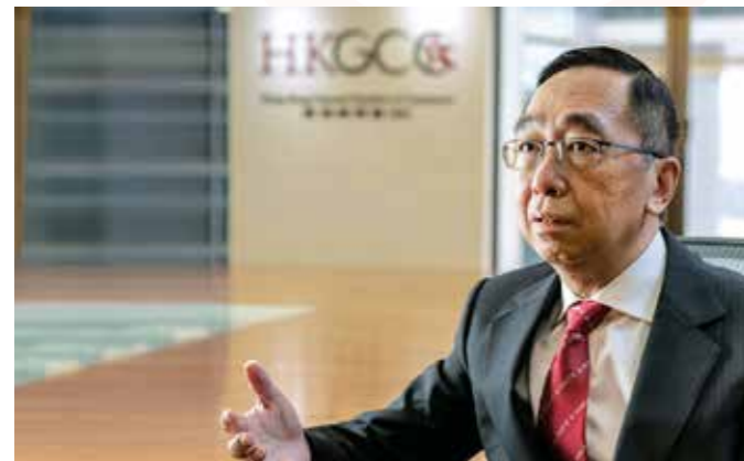
Above: George Leung, Chief Executive Officer, Hong Kong General Chamber of Commerce.

Several sources are predicting the Hong Kong economy to keep growing during 2022 although the speed of expansion is dependent on the effects of Omicron, the rate of inflation and geopolitical concerns.