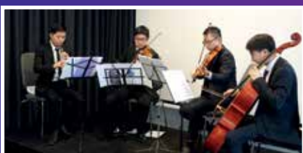
Above: Young Hong Kong musicians from the Ponte Orchestra entertain guests at a luncheon in Helsinki to welcome the Year of the Pig. The event was co-organised with the Hong Kong Trade and Development Council and Finland-Hong Kong Trade Association.