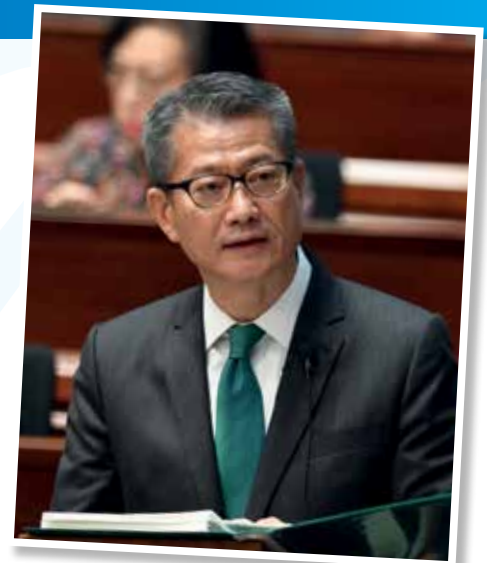
Above: Financial Secretary Paul Chan delivers the 2019-20 Budget in the Legislative Council.

Substantial sums were also allocated to healthcare, financial services, arts and culture, creative industries and tourism. He also announced that the government would issue its first batch of green bonds, with proceeds earmarked for investment in environmentally friendly projects.