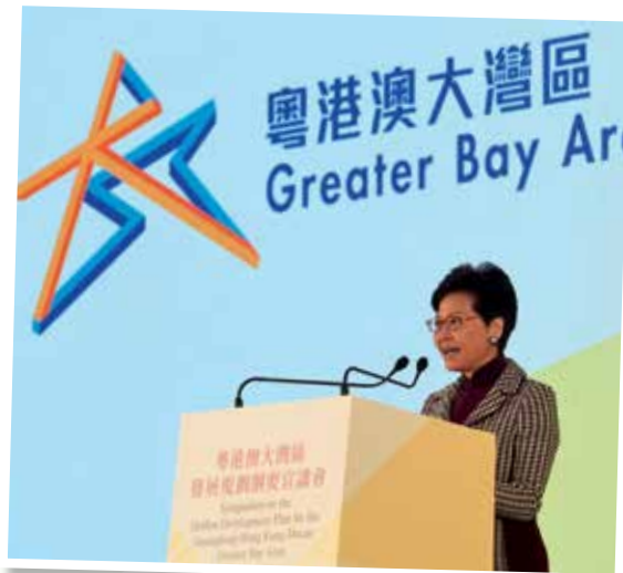
Above: Carrie Lam, Hong Kong Chief Executive, speaks at the Symposium on the Outline Development Plan for the Guangdong-Hong Kong-Macao Greater Bay Area.

To find out more about the Greater Bay Area and its Outline Development Plan visit www.bayarea.gov.hk .