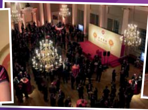
Above: Over 500 guests including Government officials, MPs, senior diplomats, academics and business people attend a Chinese New Year reception at the Banqueting House, Whitehall.