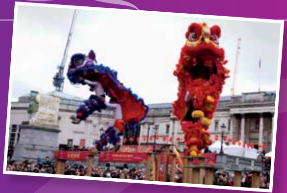
Above: A 'flying lion' performance in Trafalgar Square entertains crowds at the London Chinatown Chinese New Year celebration.