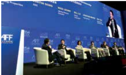
Above: Participants from around the world taking part in a panel discussion at the Asian Financial Forum 2019.

Current global tensions present opportunities for Hong Kong, said Chief Executive Carrie Lam speaking at the 12th Asian Financial Forum held in January at the Hong Kong Convention and Exhibition Centre.