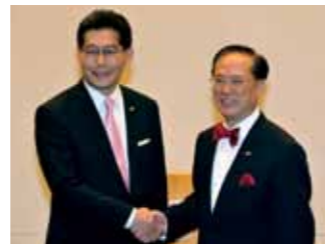
Above: The Chief Executive, Mr Donald Tsang, with Mr Gregory So (left), following his appointment as the Secretary for Commerce and Economic Development.

Mr Stephen Lam, formerly Secretary for Constitutional and Mainland Affairs, becomes Chief Secretary for Administration following the resignation of Mr Henry Tang. Mr Lam will chair major boards and committees including those for the West Kowloon Cultural District Authority and the Community Care Fund. "He will support me in preparing for a smooth handover between the current term and next term of government," said Chief Executive, Mr Donald Tsang.