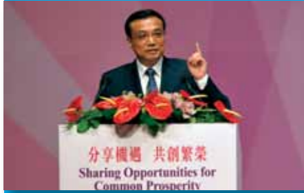
Left: Vice-Premier of the State Council, Mr Li Keqiang, delivers a keynote speech at the Forum on the National 12th Five-Year Plan and Economic, Trade and Financial Co-operation during his visit to Hong Kong in August.

Hong Kong's status as an off-shore centre for Renminbi (RMB) business will be enhanced by measures announced in August by the Central People's Government of China.