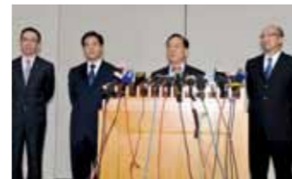
Above: The Chief Executive, Mr Donald Tsang, at a press conference with the newly-appointed Chief Secretary for Administration (2nd left), the Secretary for Constitutional and Mainland Affairs (1st right) and the Director of the Chief Executive's Office (1st left).

Four senior appointments have been made in the past few months.