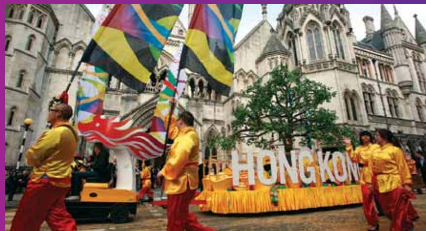
The Hong Kong float passes the Royal Courts of Justice.