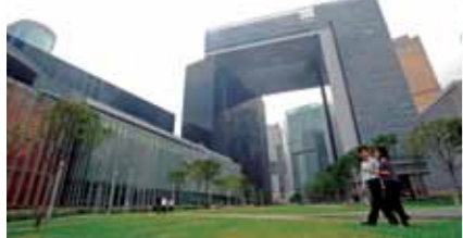
Left: Tamar Park's spacious lawn areas provide precious green open space next to the Central Government Offices, in the heart of the bustling central business district.