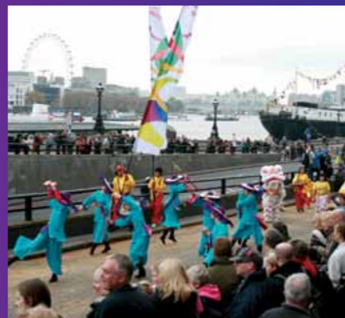
The Hong Kong float passes along Victoria Embankment.