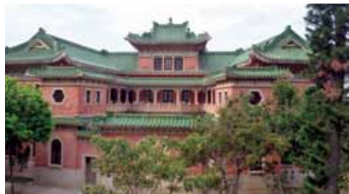
Above: King Yin Lei, one of the historic Hong Kong buildings to be revitalised under plans announced by the Government in October.

A guide for applicants and other useful information can be viewed at www.heritage.gov.hk . The deadline for submitting applications is noon on 6 February 2012.