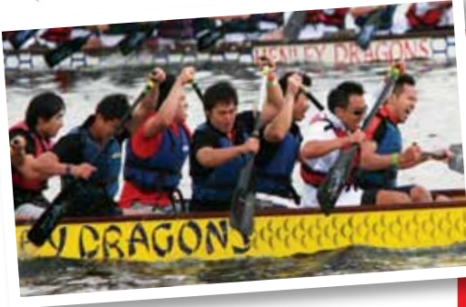
Above: Racing at the London Hong Kong Dragon Boat Festival in June.

The festival, which raises money for five local Chinese community organisations,