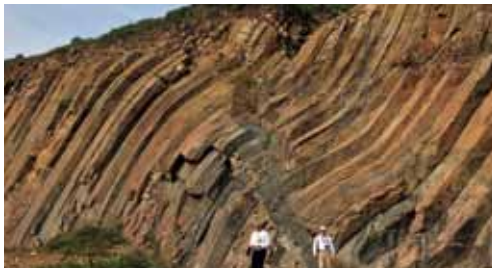
Above: The Hong Kong Geopark has attracted over 1.5 million visitors since opening in 2009.