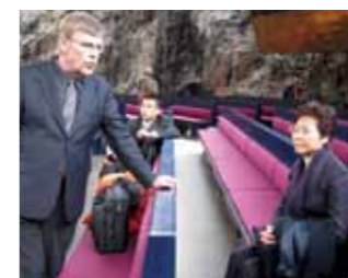
Above: Secretary for Development, Mrs Carrie Lam, visits the underground Rock Church in Helsinki, Finland.

The latest developments in green building technology were highlighted at a major international conference in Helsinki, Finland, in October.