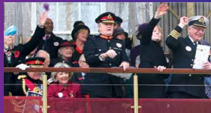
VIPs at the Mansion House throw lucky wishing beanbags into the Wishing Tree.