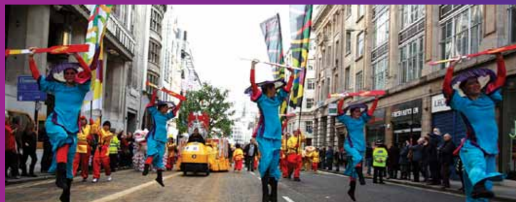
A contemporary dance troupe performs an updated version of Hong Kong's dragon boat dance.