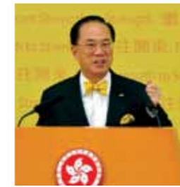
Above: Hong Kong Chief Executive, Mr Donald Tsang, holds a press conference at Central Government Offices, Tamar, after delivering the 2011-12 Policy Address at the Legislative Council.

In financial services, Mr Tsang outlined strategies to reinforce Hong Kong's role as an offshore Renminbi (RMB) centre, establishing strong and extensive links with the Mainland's onshore RMB market.