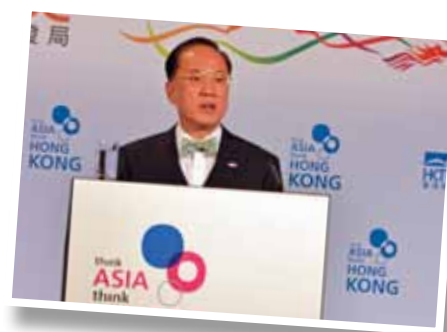
Above: Hong Kong Chief Executive, Mr Donald Tsang, gives an opening speech at the "Think Asia, Think Hong Kong" Symposium.

Mr Tsang pointed, in particular, to the internationalisation of the Renminbi (RMB), China's official currency, and the launch of RMB banking in Hong Kong in 2004. "Today, almost 130 authorised institutions [in Hong Kong] are engaged in RMB business," said Mr Tsang, noting that total RMB deposits in Hong Kong at the end of July 2011 amounted to 570 billion.