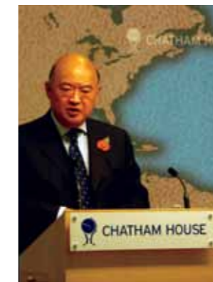
Above: Hong Kong's Chief Justice, the Hon. Geoffrey Ma, speaking at Chatham House in November.

The rule of law in Hong Kong was the topic of two speeches by Hong Kong's Chief Justice, the Hon. Geoffrey Ma, during his recent visit to London. The engagements were organised by Hong Kong Economic and Trade Office, London, in association with the Royal Institute of International Affairs (Chatham House), and the Hong Kong Public Affairs and Social Service Society of the London School of Economics respectively.