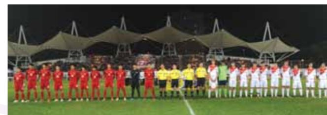
Above: The Hong Kong Youth Representative Team (left) and the Russian National Youth Team pose for a group photo before their match.

The Russian National Youth Football Team flew to Hong Kong in November to play two friendly matches against Hong Kong youth teams, including one held at the Mong Kok stadium to mark its re-opening following extensive renovation.