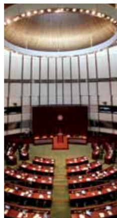
Above: The new chamber in the LegCo Complex.

The new Tamar Park has also been created as part of the complex, to provide workers in the district with a welcome oasis of calm in the busy city.