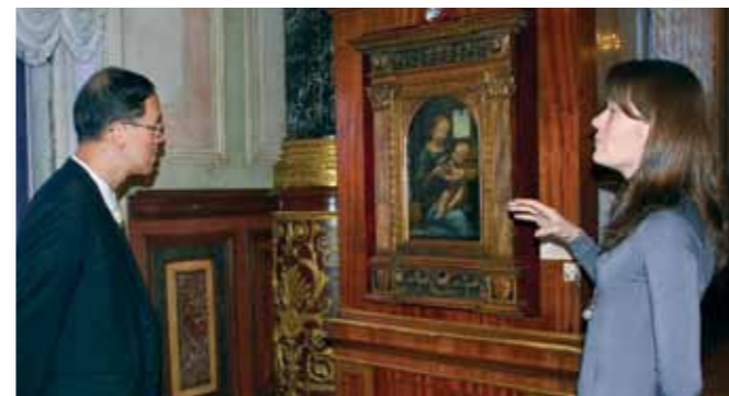
Left: Mr Tsang Tak-sing, Secretary for Home Affairs, appreciates a masterpiece during his visit to the State Hermitage Museum in St Petersburg.

Cultural and artistic links between Hong Kong and Russia are set to strengthen following the signing of a memorandum of understanding on cultural co-operation in September.