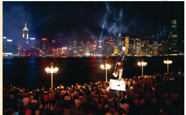
The light show is being expanded to enhance its visual impact.

On the evening of the presentation, a special light-up event was held to mark the completion of lighting installations for government buildings along the Kowloon waterfront – the Hong Kong Cultural Centre, Hong Kong Museum of