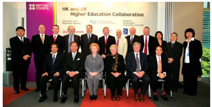
Hong Kong aspires to become the region's educational hub.