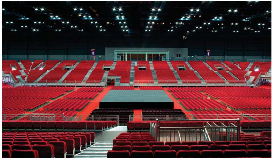
Above: The 13,500-seat arena in AsiaWorld-Expo gives some idea of the scale of the complex. Below left: Chief Executive Donald Tsang (fifth from left) leads the toast at the opening of AsiaWorld-Expo, Hong Kong's largest exhibition and events complex. Below right: The AsiaWorld-Expo complex is strategically placed adjacent to Hong Kong International Airport and has its own Mass Transit Railway station.

Comprehensive cross-border bus services also