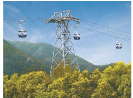
Eventually, more than 100 cabins will carry visitors along the 5.7 km aerial ride.

Ngong Ping Village, adjacent to the Ngong Ping Skyrail Terminal, occupies a 1.5 hectare site and has been designed to reflect and maintain the cultural and spiritual integrity of the local area. As well as incorporating several major themed