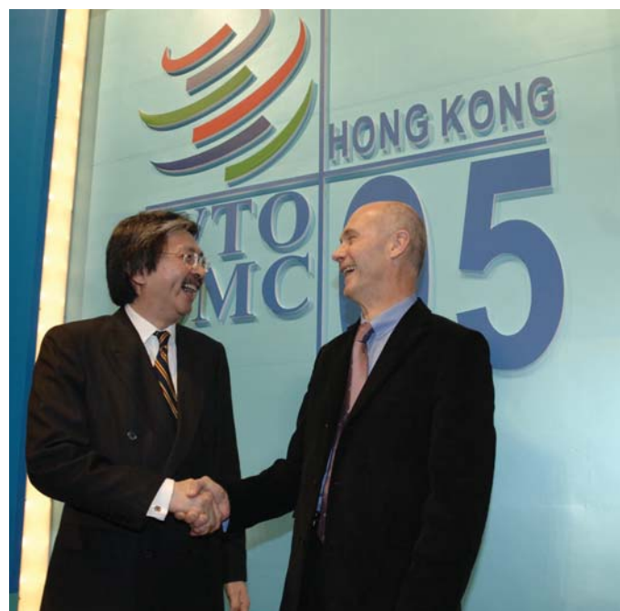
The relief shows as Mr Tsang and Mr Lamy mark the end of the Closing Plenary Session.