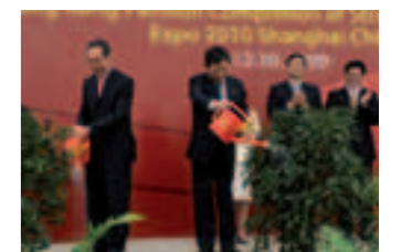
Mr Tang and Mr Yang take part in a tree-planting ceremony at the Shanghai Expo's Hong Kong Pavilion

Chief Secretary for Administration Henry Tang and Executive Vice Mayor of Shanghai City Yang Xiong went to the site. Mr Tang described the structure's completion as a major milestone and said: "We aim to complete all works before the end of March 2010. We attach great importance to this invaluable opportunity to showcase Hong Kong as Asia's world city."