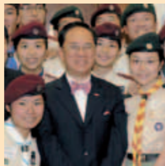
The policy address includes (clockwise from above): additional support for youth organisations; further development of professional testing and certification services; steps to promote Chinese medicine

Other measures include promoting the use of