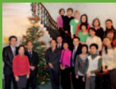
Christmas and New Year greetings from all the team at the Hong Kong Economic and Trade Office, London!

Visit www.hketolondon.gov.hk for updates