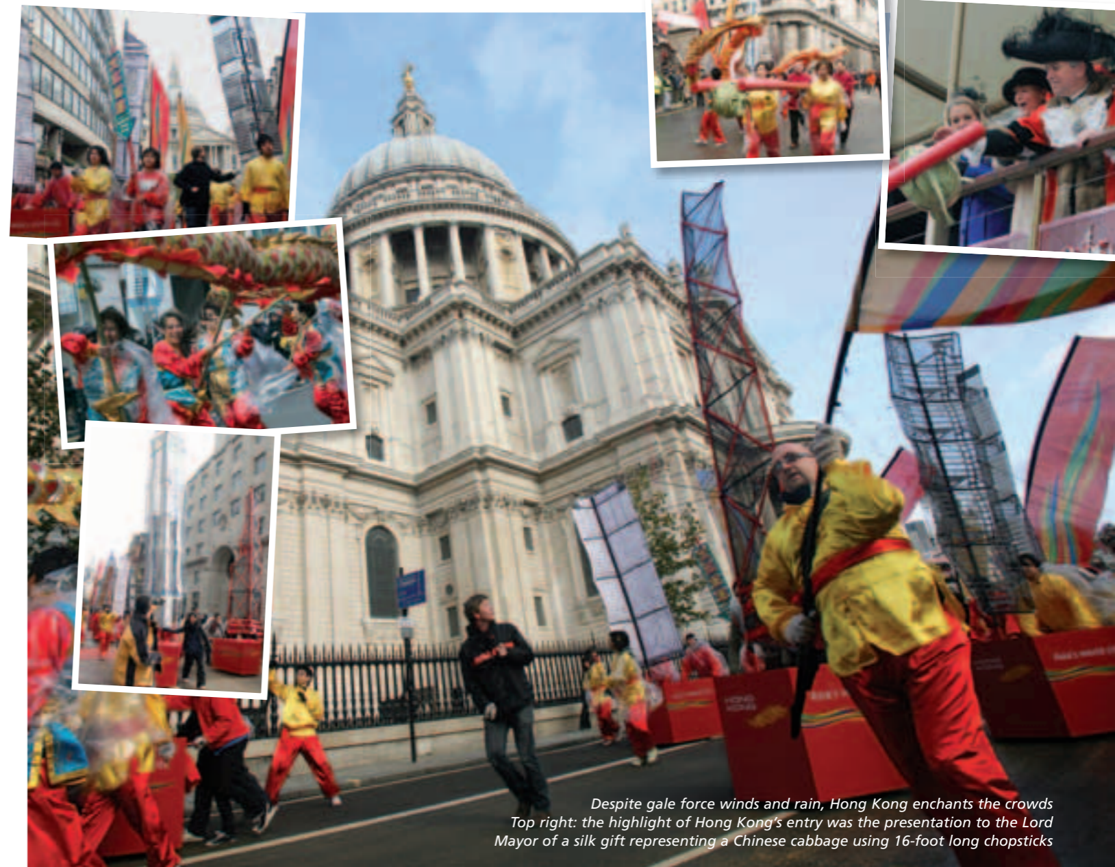
Despite gale force winds and rain, Hong Kong enchants the crowds. Top right: the highlight of Hong Kong's entry was the presentation to the Lord Mayor of a silk gift representing a Chinese cabbage using 16-foot long chopsticks