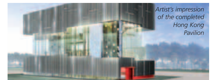
Artist's impression of the completed Hong Kong Pavilion

The key theme for the expo is 'Hong Kong – A City with Unlimited Potential'. The pavilion and exhibition will be on show during the Shanghai Expo period from 1 May to 31 October. www.hkexpo2010.gov.hk