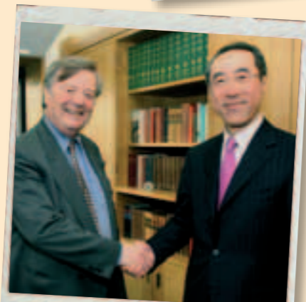
Updating Shadow Business Secretary Kenneth Clarke on the latest economic developments in Hong Kong